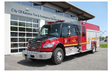
4 Rescue Fire Truck