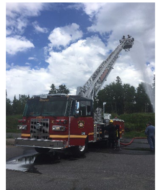
6 Ariel Platform Truck