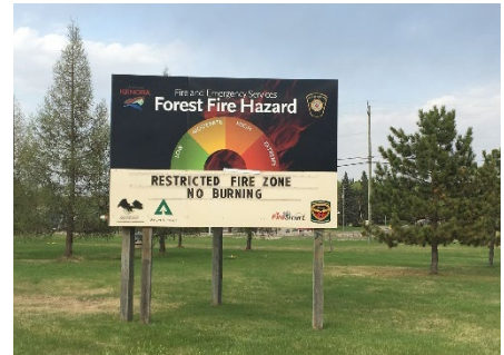
3 Forest Fire Hazard Sign

We seek candidates, residents, who are representative of the community we serve. If you are physically fit, enjoy learning, work well with others and enjoy helping others, then you are a potential candidate for a paid per call firefighter position.