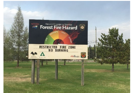
3 Forest Fire Hazard Sign

We seek candidates, residents, who are representative of the community we serve. If you are physically fit, enjoy learning, work well with others and enjoy helping others, then you are a potential candidate for a paid per call firefighter position.