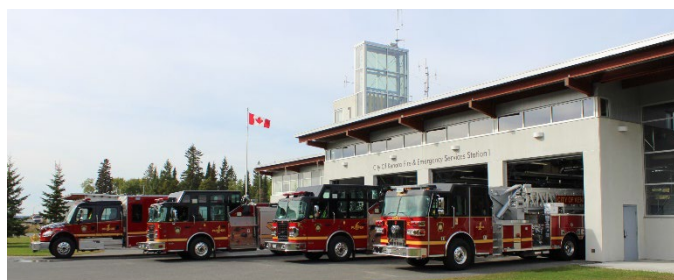
1 Fire Station One and Fire Fleet