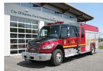
4 Rescue Fire Truck