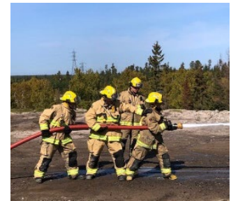
5 Group Training

To ensure that all members of the fire department are prepared to deliver the best level of services required, training standards have been developed to provide each member with the needed skills, knowledge, and abilities necessary to deliver fire and emergency services to the citizens of the municipality.