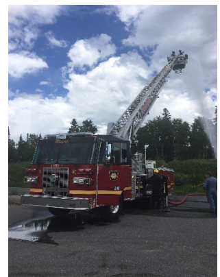
6 Ariel Platform Truck